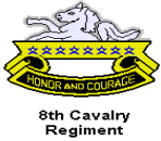
8th Cavalry Regiment